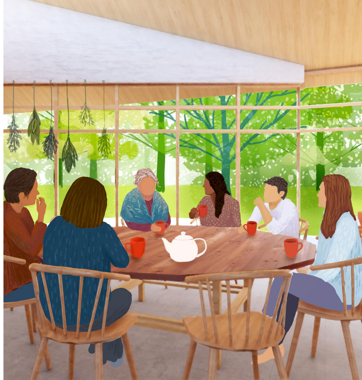
Architectural Design by: JLRichards and Associates Inc.